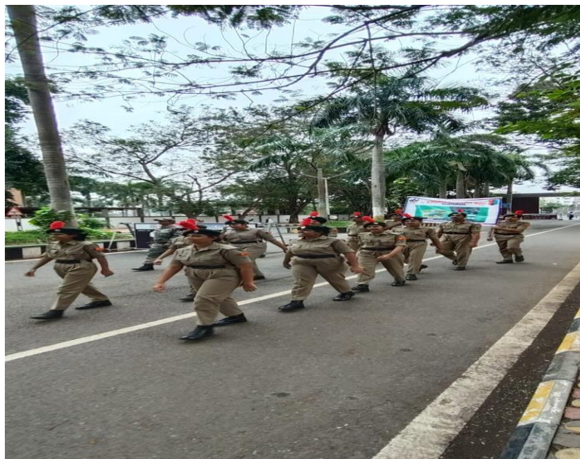
Cadets participating in the rally organized by 1(A) EME COY NCC On the occasion of National Pollution Day