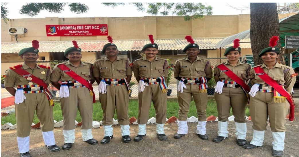
Guard Of Honour Team, PVPSIT