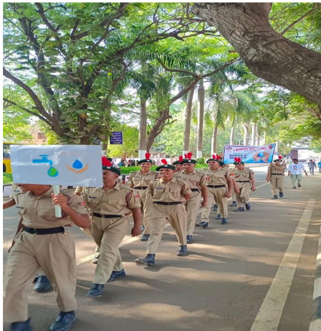
Cadets participating in the rally organized by 1(A) EME COY NCC On the occasion of World Water Day