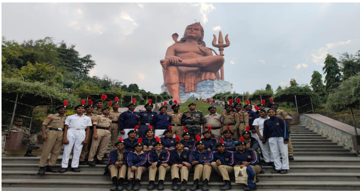
Group photo of Kakinada group at statue of Belief, Udaipur