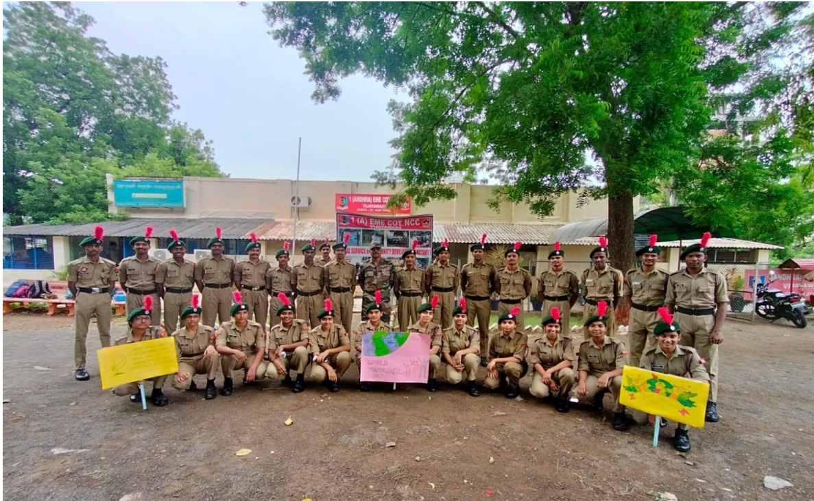
Group photo of cadets on the occasion of World youth skills Day