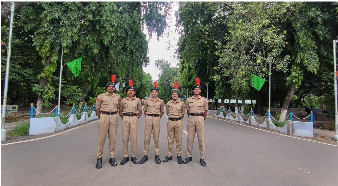
Group photo of PVPSIT cadets on the occasion of Kargil Vijay Diwas