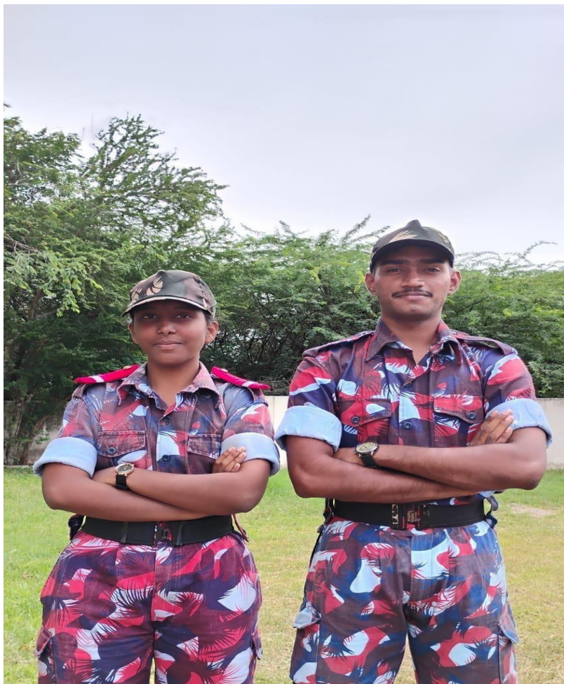
TRG Camp–I Competition Team, PVPSIT

37. From August 01 to August 10, 2024, our NCC team, consisting of two members, participated in the All India Thal Sainik Camp – Training- I held at Anantapur.