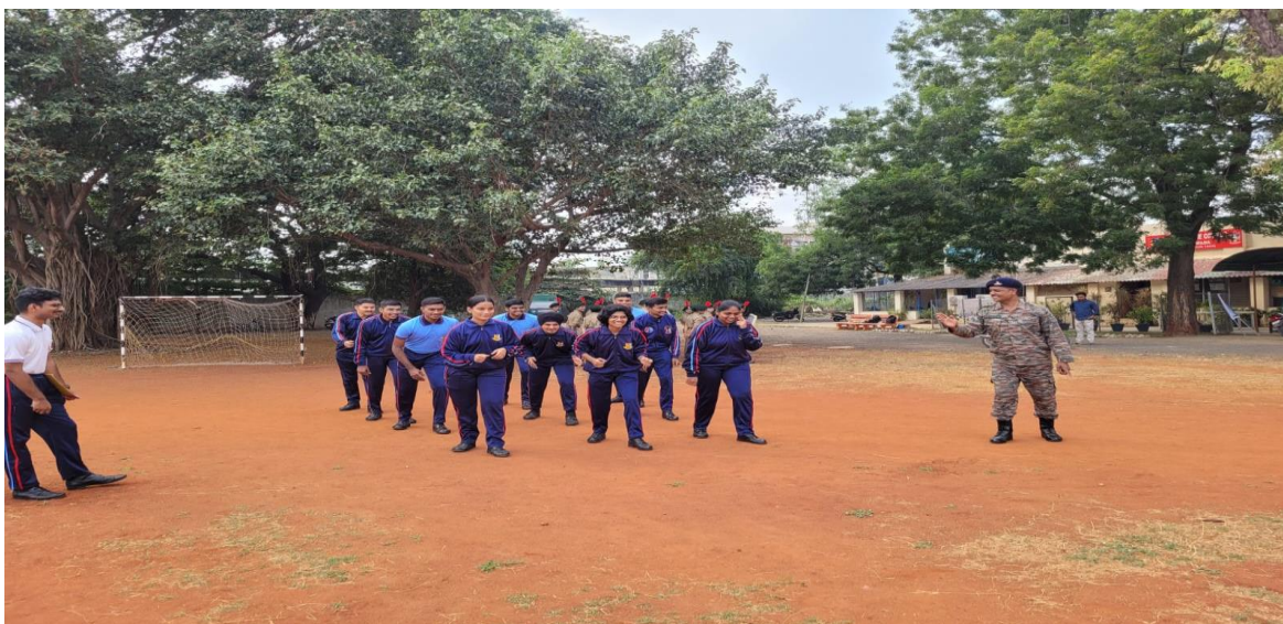
Cadets participating in the Healthy Run organized by 1(A)EMECOY NCC on the occasion of Armed Forces Flag Day