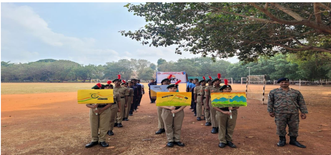
Cadets participating in the rally organized by 1(A)EME COY NCC On the occasion of Armed Forces Flag Day