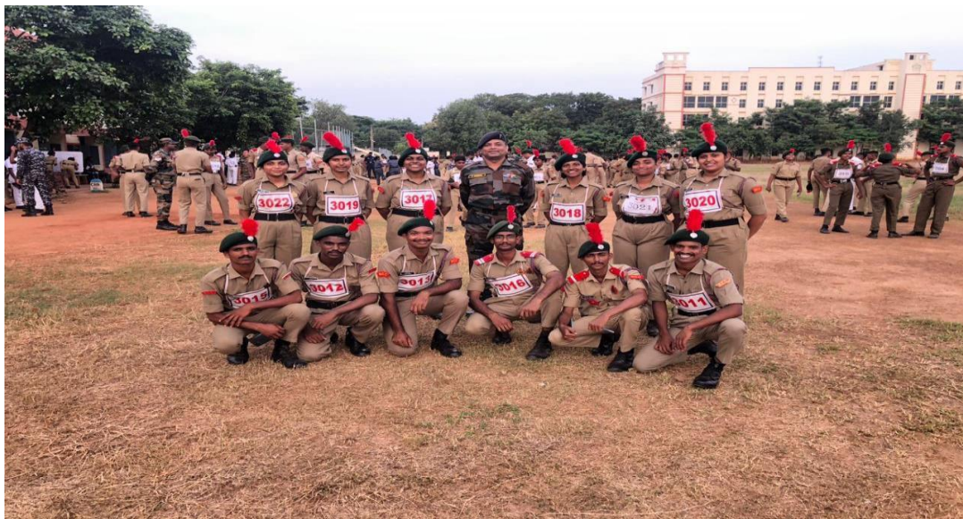
Group Photo of RDC Group selection camp Team, PVPSIT