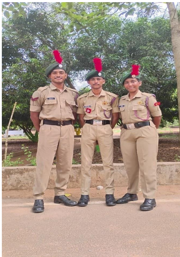
PVPSIT cadets at Group Selection Camp Thal Sainik Camp

47. From June 8 to June 17, 2024, our NCC team, consisting of three members, participated in the Group Selection Camp at Aditya Engineering College in Surampalem and were selected for Inter-Group Competition Launching.