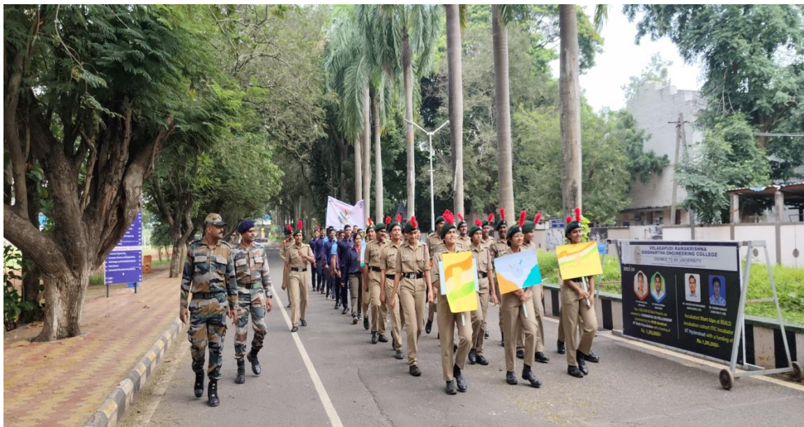
Cadets participating in the rally organized by 1(A) EME COY NCC On the occasion of National Youth Day