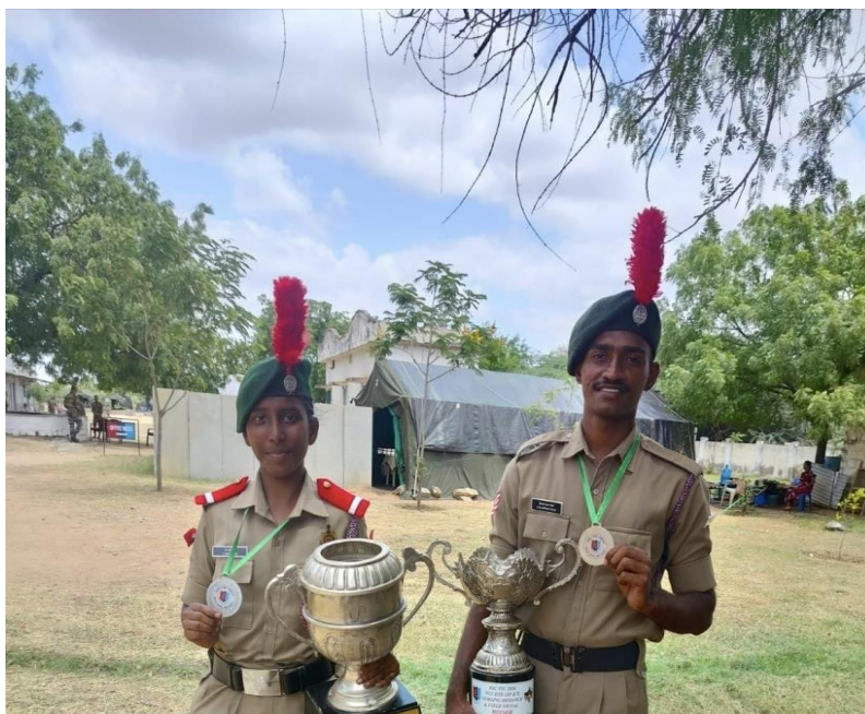
AITSC TRG Camp –II Team, PVPSIT

35. From August 11 to August 20, 2024, our NCC team, consisting of two members, participated in the All India Thal Sainik Camp – Training- II held at Anantapur.