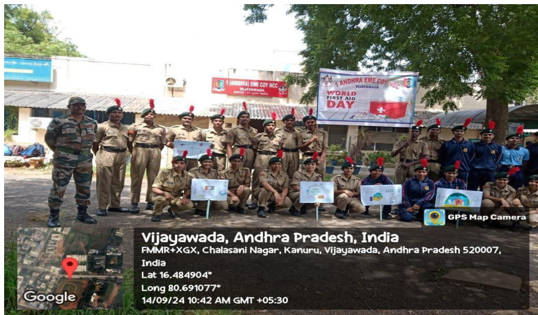
Group photo of cadets on the occasion of World First Aid Day