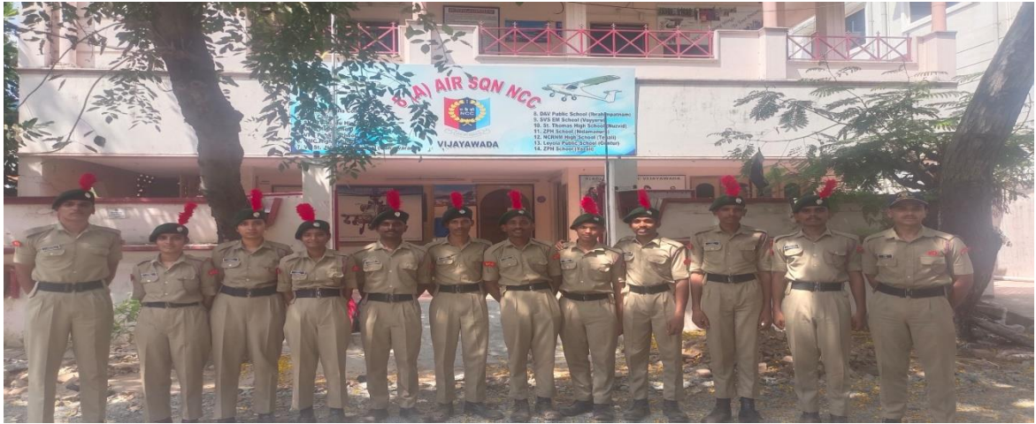
Group photo of cadets at Firing Range, Mangalagiri.