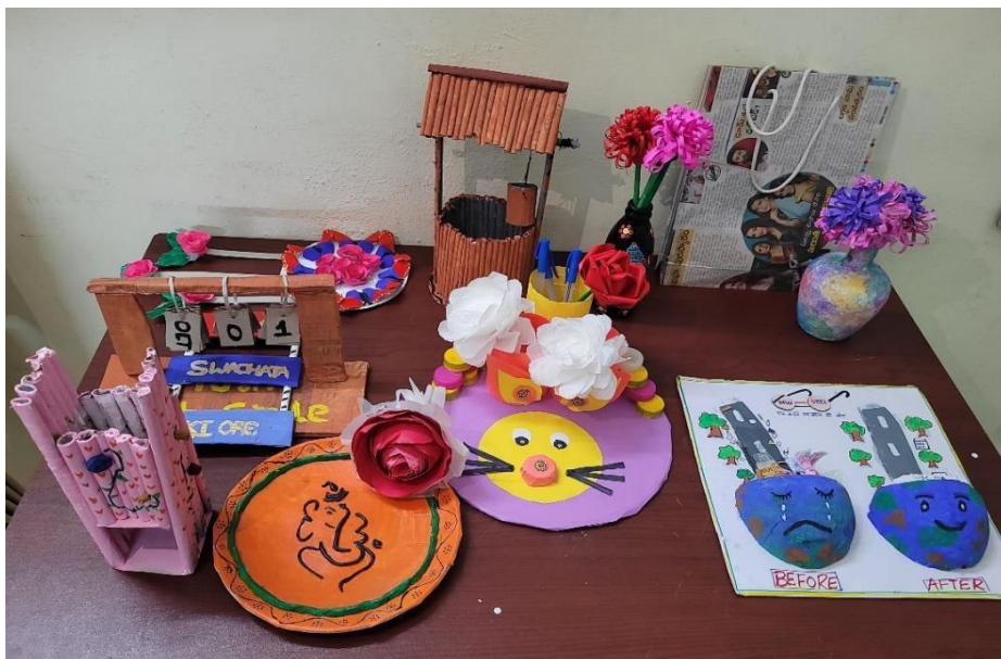
Glimpses of Innovations made from the Waste