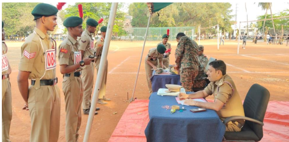
Glimpses of C practical examination