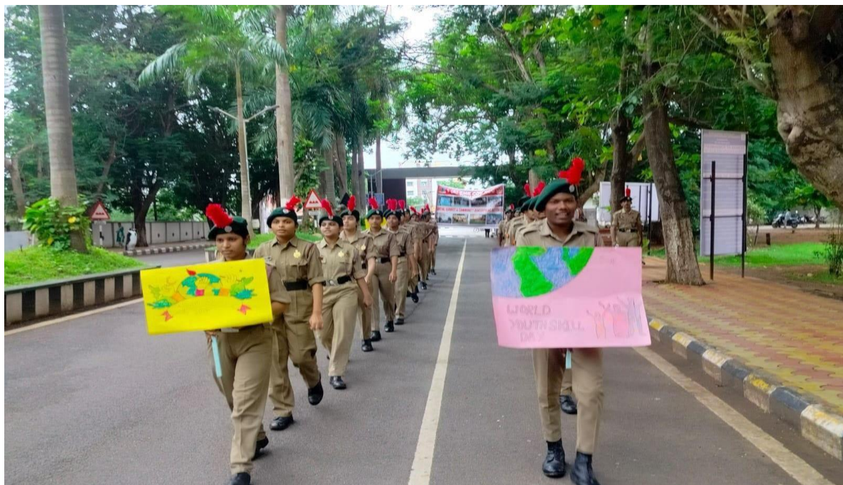
Cadets participating in the rally organized by 1(A)EMECOYNCC On the occasion of World Youth skills Day