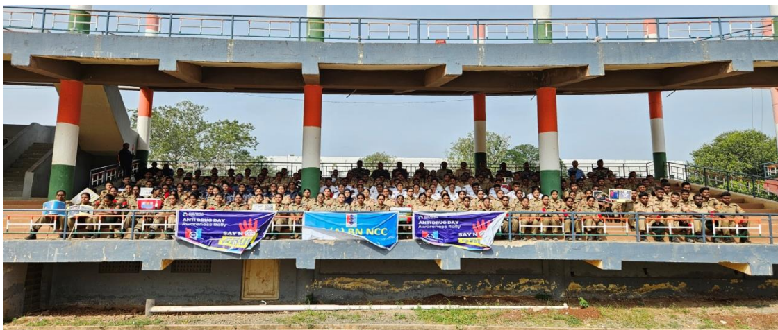
Glimse after Anti Drug Rally