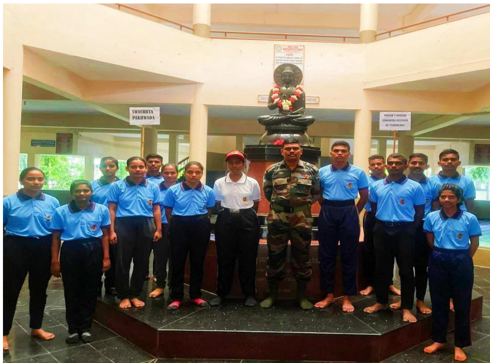
Glimpses of Swachhta Pakhwada