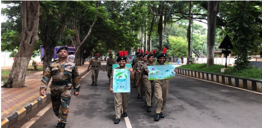
Cadets participating in the rally organized by 1(A) EM COY NCC on the occasion of International Ocean Day