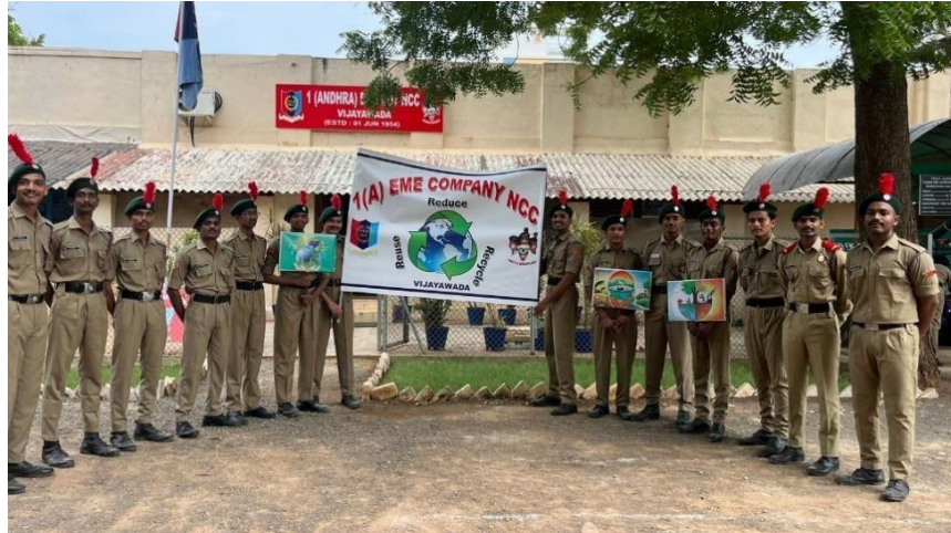
Group Photo of Cadets on the occasion of World Environment Day