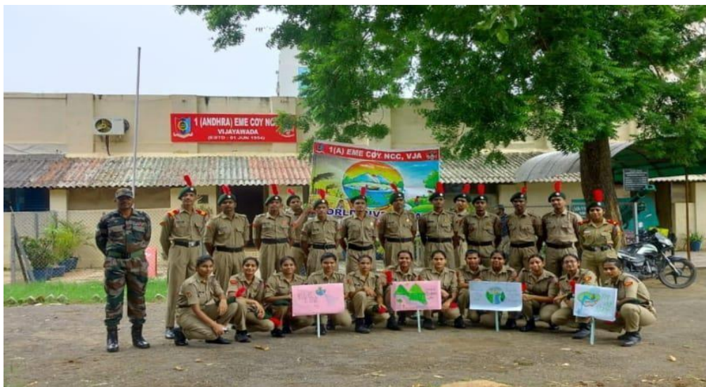
Group photo of cadets on the occasion of World Rivers Day