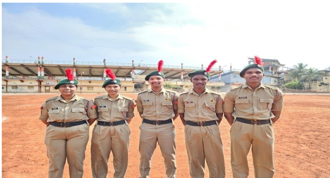
Group photo of NCC Cadets, PVPSIT