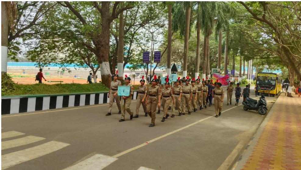
Cadets participating in the rally organized by 1(A) EME COY NCC On the occasion of International Women's Day