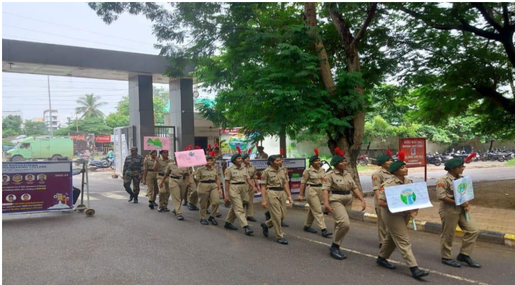
Cadets participating in the rally organized by 1(A)EME COY NCC On the occasion of World Rivers Day