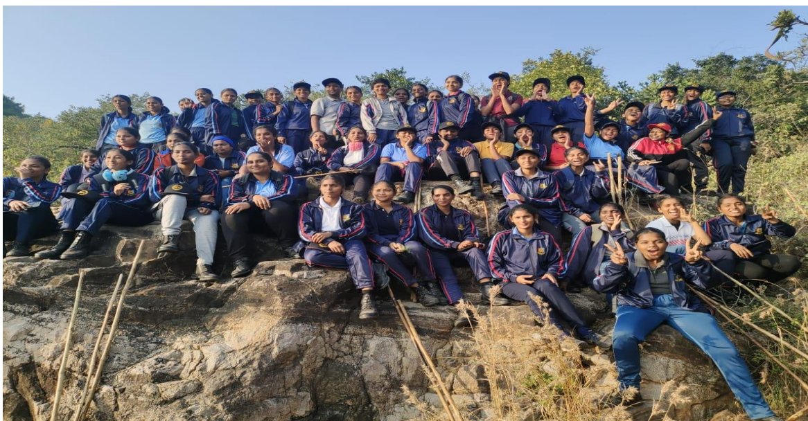
Group photo of Trek Team at Kondapalli Fort