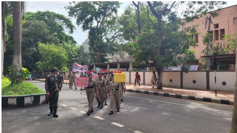
Cadets participating in the rally organized by 1(A) EME COY NCC on the occasion of International Day against drug abuse & illicit