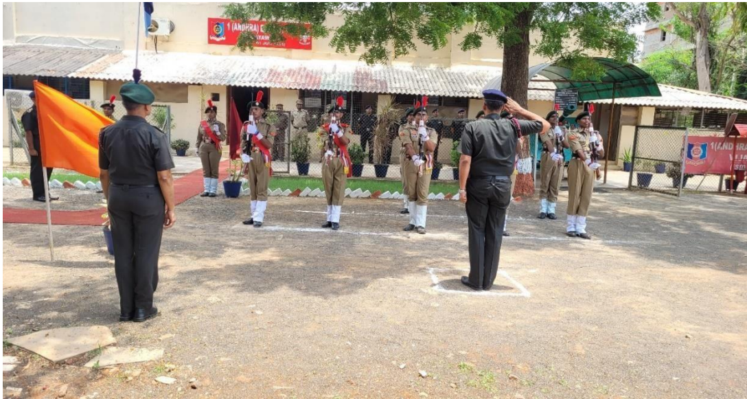
Group Commander, Kakinada Group reviewing the Guard Of Honour