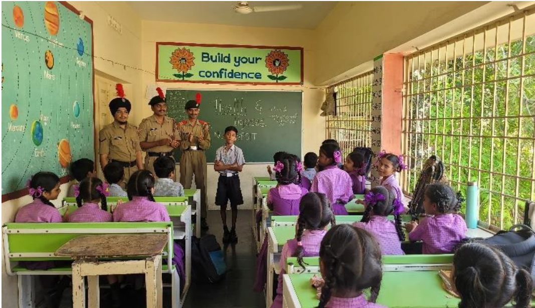
Glimpses of interaction with the students