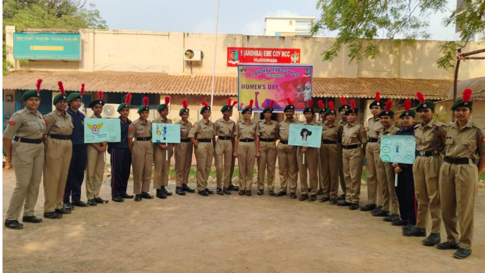
Group photo of cadets on the occasion of International Women's Day