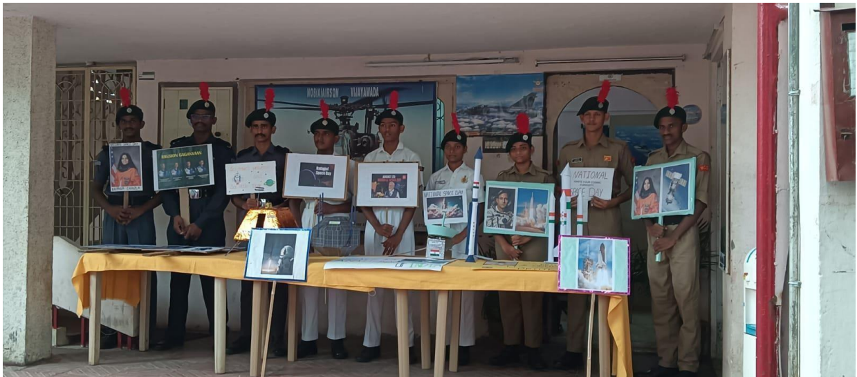
Glimpse of Space Expo on the occasion of National Space Day

32. National Space Day, aims to raise awareness about the significance of space exploration and the need to inspire the next generation of explorers. In celebration of this important day, our NCC team, comprising 8 members, participated in a rally organized by 8(A) AIR SQN NCC in Vijayawada. The rally emphasized the importance of advancing space technology and research to ensure a bright future, promoting responsible exploration and community engagement in space sciences.