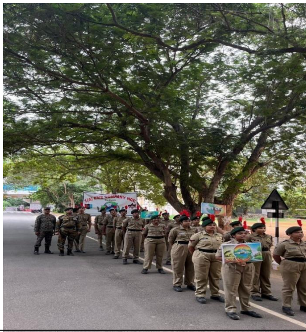
Cadets participating in the rally organized by 1(A) EMECOY NCC on the occasion of World