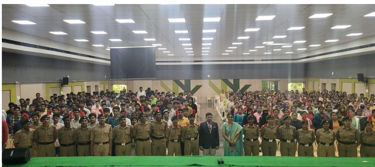
Group photo–NCC Orientation held for 1 st B.Tech Students