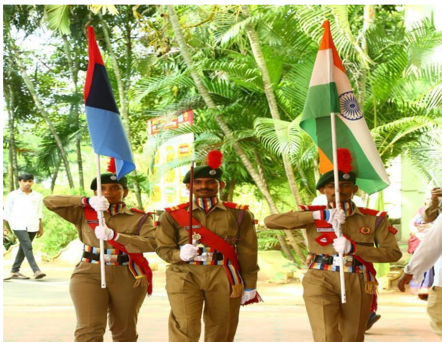
Glimpse of Nishan-Tholi