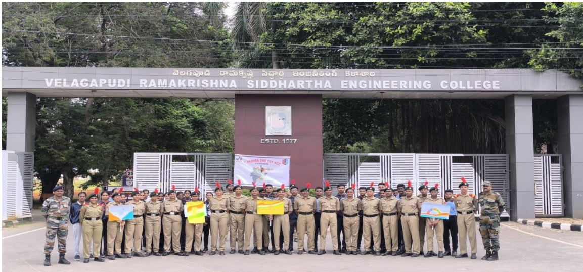
Group photo of cadets on the occasion of National Unity Day