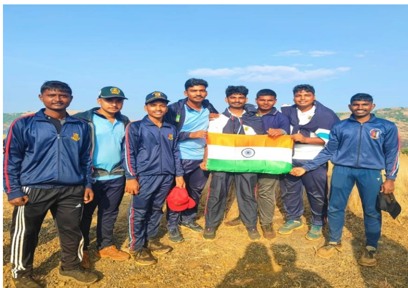
Group photo of Trek Team at Fort Vishalgad