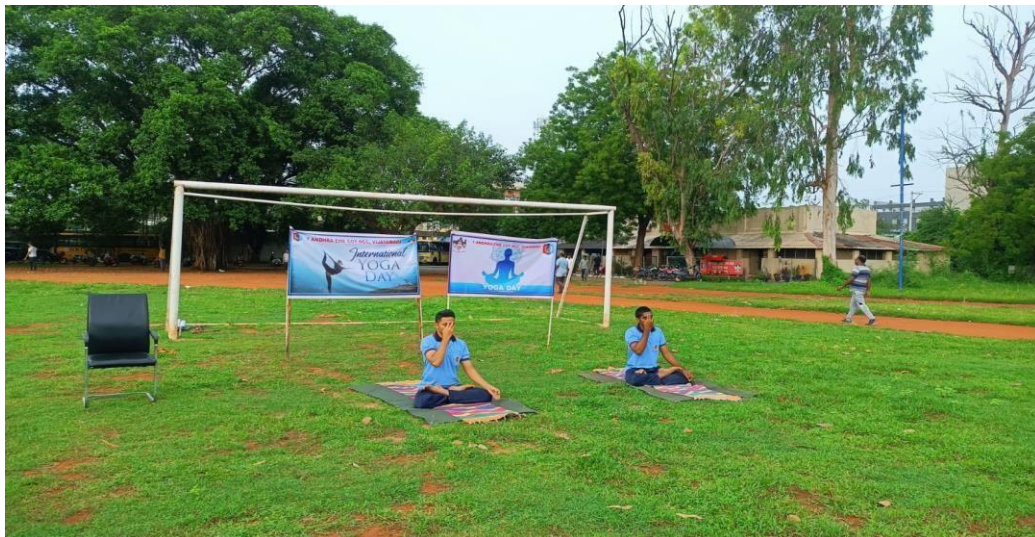
Glimpse of Cadet Yoga Instructors