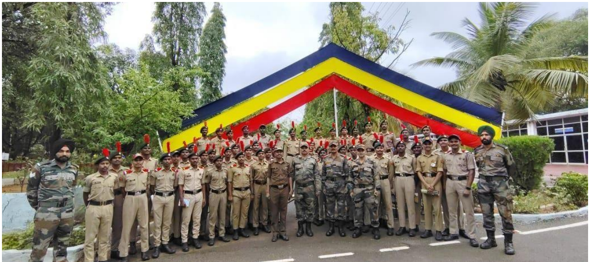
Group Photo, Army Attachment Camp