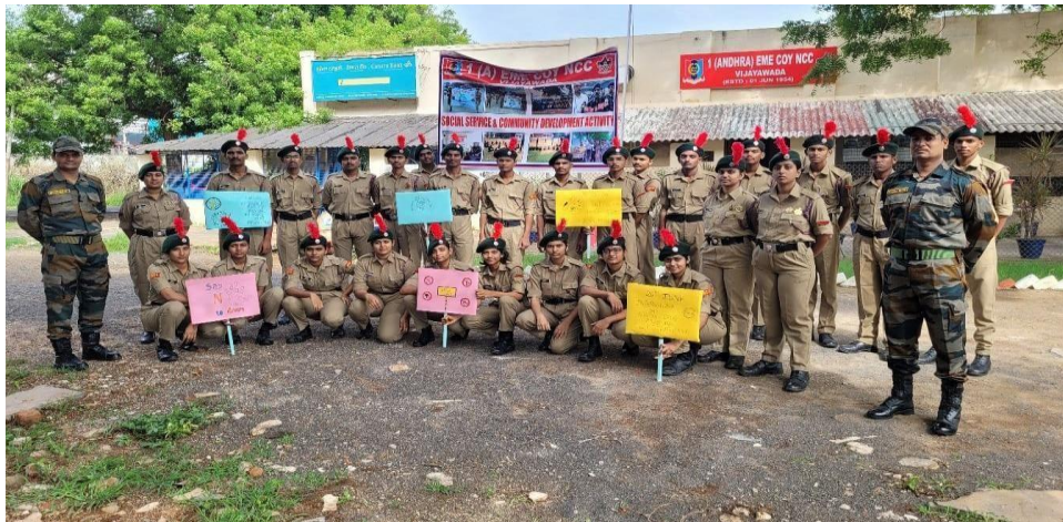
Group Photo of Cadets on the occasion of International Day against drug abuse & illicit trafficking