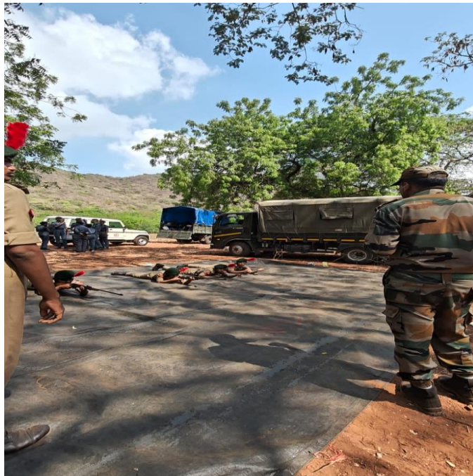
Glimpse of Firing at Firing Range, Mangalagiri.