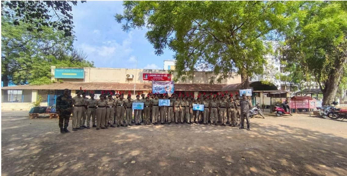
Group photo of cadets on the occasion of World Water Day