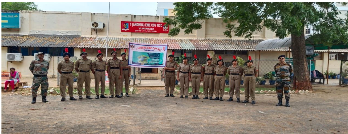
Group photo of cadets on the occasion of National Pollution Control Day