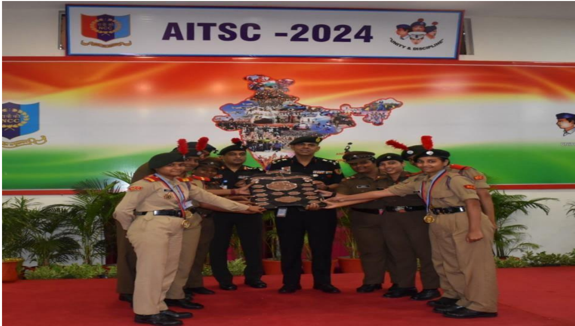
Health & Hygiene team receiving the shield at AITSC