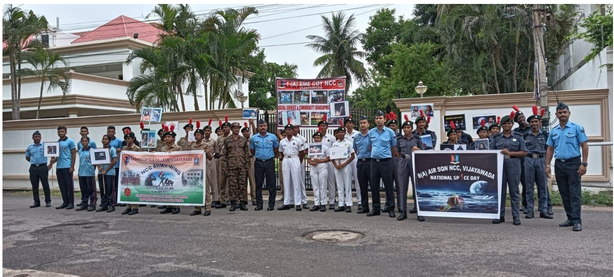
Group Photo on the occasion of National Space Day