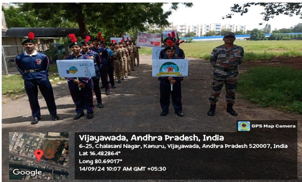
Cadets participating in the rally organized by 1(A) EME COY NCC On the occasion of World First Aid Day