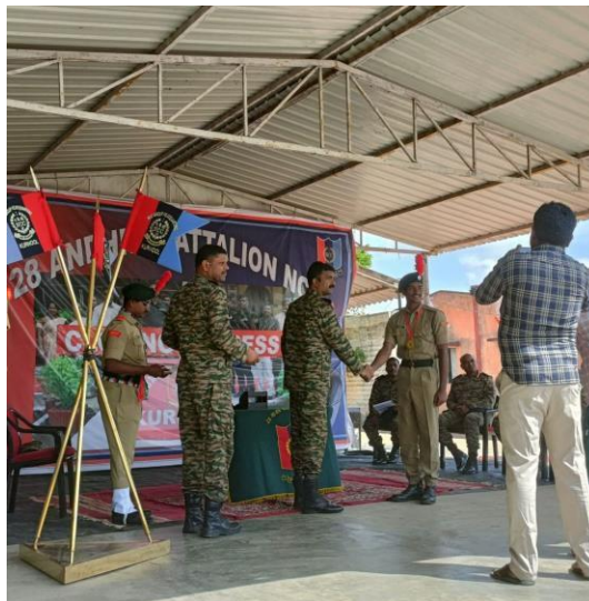
Glimpse of PVPSIT Cadets receiving medal at Inter – Group Competition