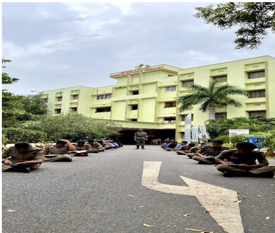
Glimpses of Essay Writing Competition