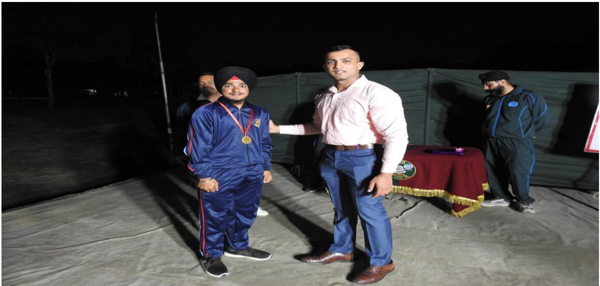
Glimpse of PVPSIT Cadet receiving medal at Army Attachment Camp