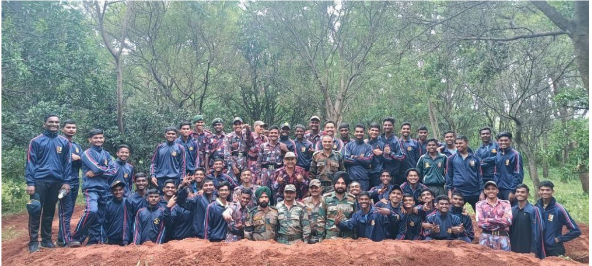
Glimpse of Army Attachment Camp