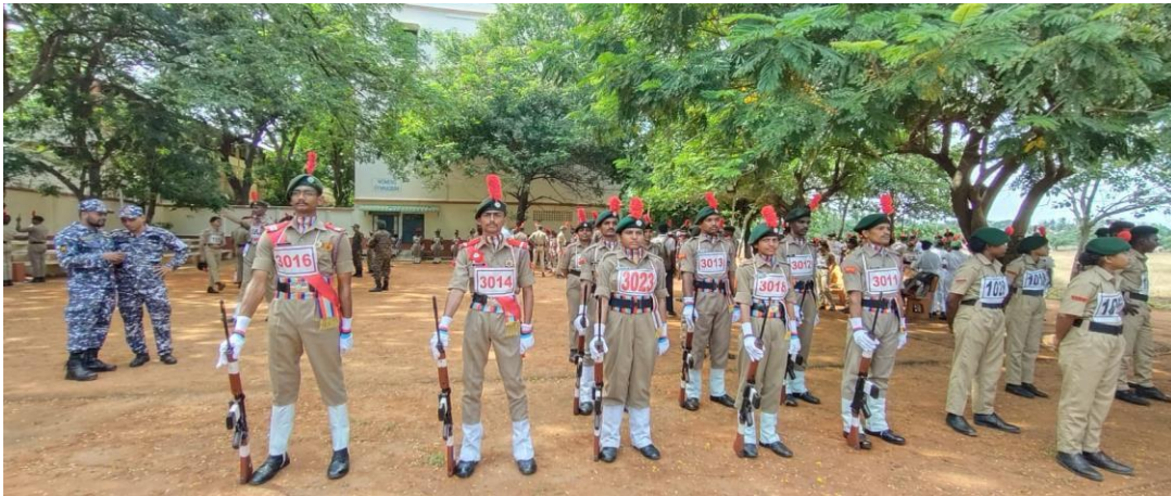
Glimpse of RDC Group selection camp

28. From 08 September to September 17, 2024, our NCC team, consisting of 09 members, participated in the Group Selection Camp – IGC RDC organized by the 19(A) BN NCC at Sir CR Reddy College, Eluru.