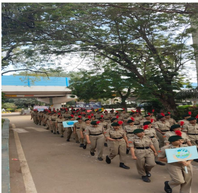
Cadets participating in the rally organized by 1(A)EME COY NCC On the occasion of World Wet Land Day