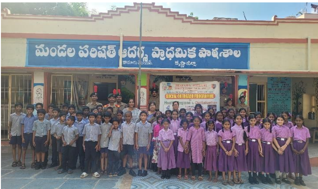
Group Photo With the Students and Teachers of the school