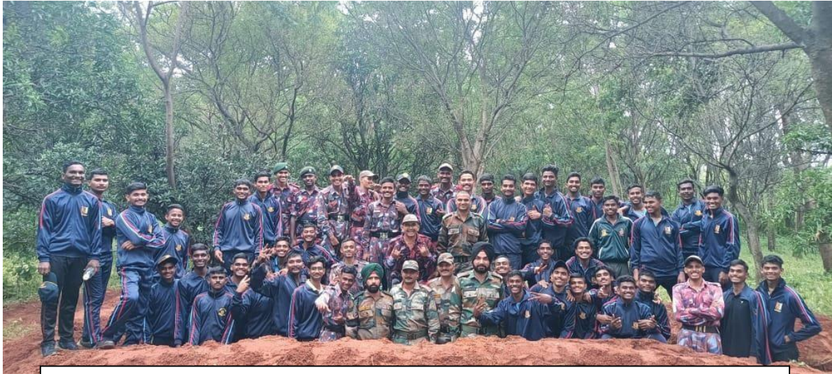
Group Photo of Army Attachment Team

27. From September 09 to September 18, 2024, our NCC team, consisting of four members, participated in the Army Attachment Camp held organized by the 76 INF at Secunderabad.