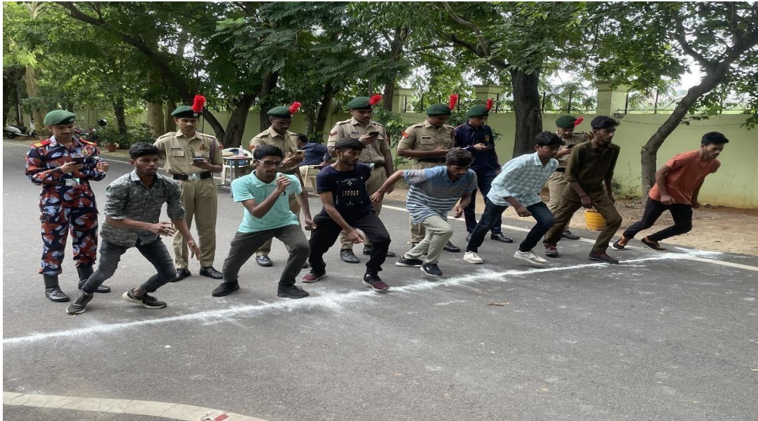
Glimse Of NCC Enrollment 2024-25

36. NCC Enrollment for the year 2023-2024 was conducted by 1(A) EME COY at our college on August 25, 2023. The enrollment was open to second-year students.