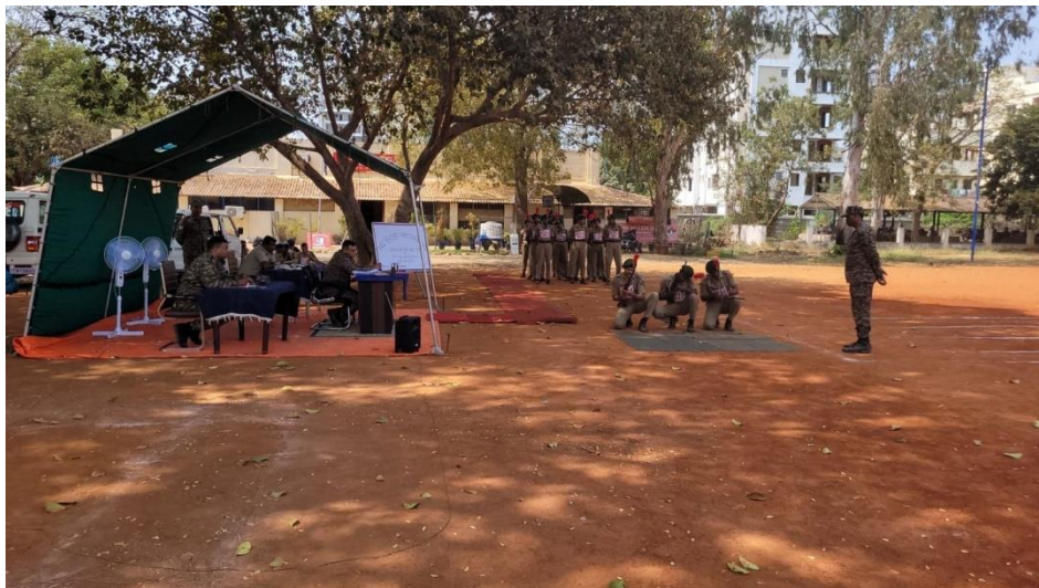
Kholna aur Jhodna of .22 Rifle