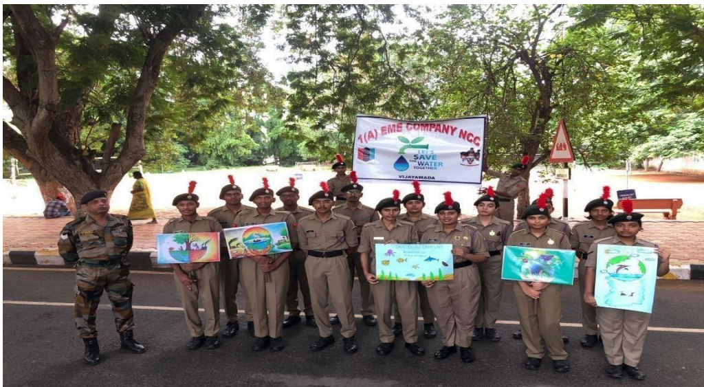
Group Photo of Cadets on the occasion Of International Ocean Day