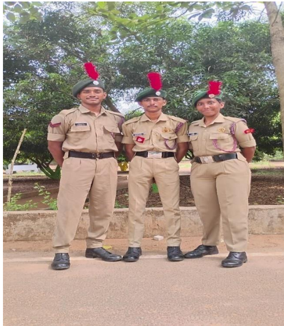
TSC TEAM, PVPSIT

a. Cadets selected for Inter-Group Competition, Thal Sainik Camp: