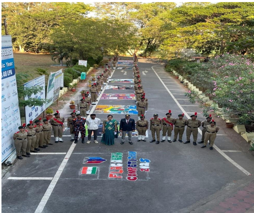
Glimpses of Flag Area Competition