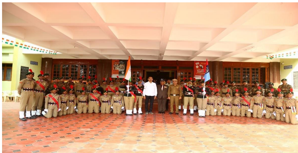
Group photo of team PVPSIT