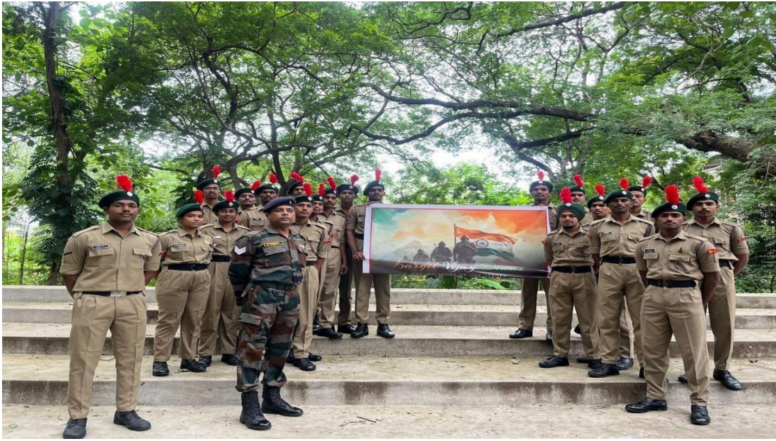
Glimpse of Kargil Vijay Diwas