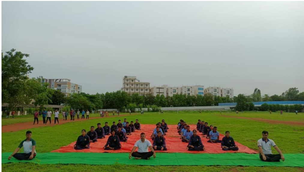
Cadets performing Yoga on the occasion of International Yoga Day at Unit Office, 1(A) EME COY NCC