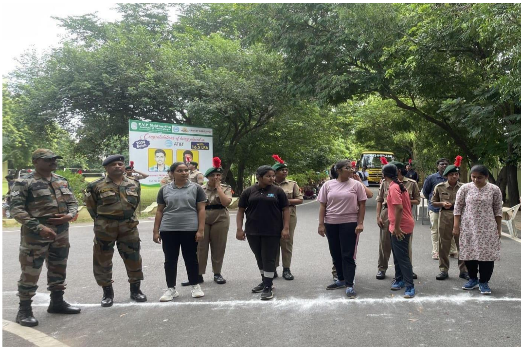
Participants in line for 400mts race during the Enrollment