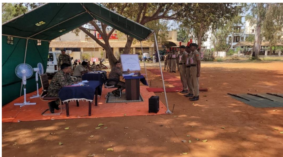
Glimpses of B practical examination